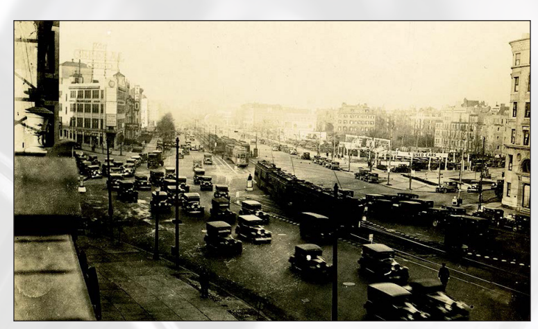
Kenmore Square Site of original Bearings Specialty location