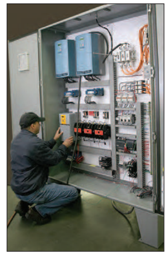
Slitting Line Control