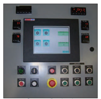
Operator Panel with Touchscreen HMI