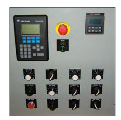
Operator Control Station