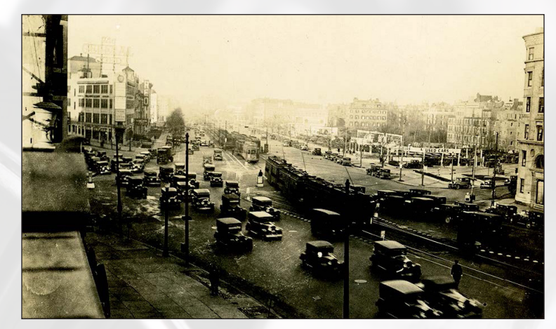
Kenmore Square Site of original Bearings Specialty location