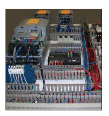
Work in Process