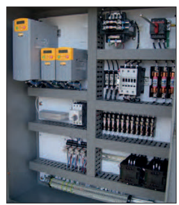
3 Drive System with Temperature Control