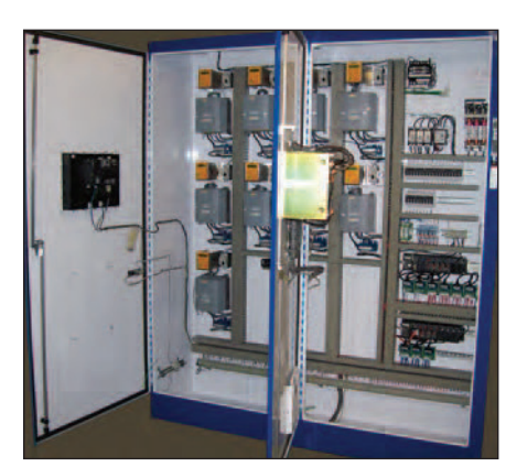
Multi Drive System with Data Acquisition