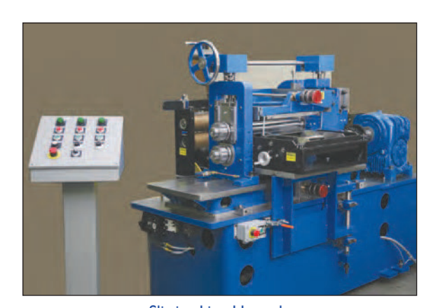
Slitting Line Upgrade