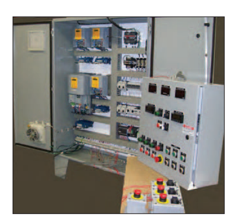
Completed System Test